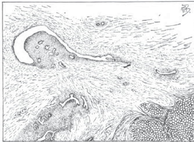
FIG. 2.—Sixteen times enlargement of a portion of the adenomyoma. The specimen consists chiefly of non-striated muscle fibres. In the right lower corner are masses of fat cells, and near the left lower corner are several fat cells. In the vicinity of the left upper corner is a pseudo-glomerulus; this is composed of stroma, scattered throughout which are cross-sections of several glands. The surface of the glomerulus is covered by one layer of cylindrical epithelium, and its capsule is composed of one layer of cells which in places are cuboidal or almost flat. The cells of the capsule have practically no underlying stroma, but lie directly on the muscle fibres. The space between the pseudo-glomerulus and the capsule is, on tracing it to the right, seen to be continuous with a gland cavity, and is nothing more than a dilated portion of the gland. Above and to the right of the pseudo-glomerulus are cross-sections of two glands, below it are several longitudinal sections, one showing dichotomous branching. All of the glands are surrounded by stroma, which separates them from the muscle.

are directly continuous with those of the pseudo-glomerulus. The space between the capsule and the glomerulus may be empty; many, however, contain desquamated epithelial cells, some of which are vacuolated and contain brown granular pigment. Numerous spaces contain red-blood corpuscles. On tracing one of the spaces laterally it is found to be directly continuous with the lumen of a gland. The capsule forms one wall of the gland and the pseudo-glomerulus the other, Fig. 2. In other words, the space between the capsule and the so-called glomerulus is nothing more than a dilatation of the gland cavity. In numerous places the gland