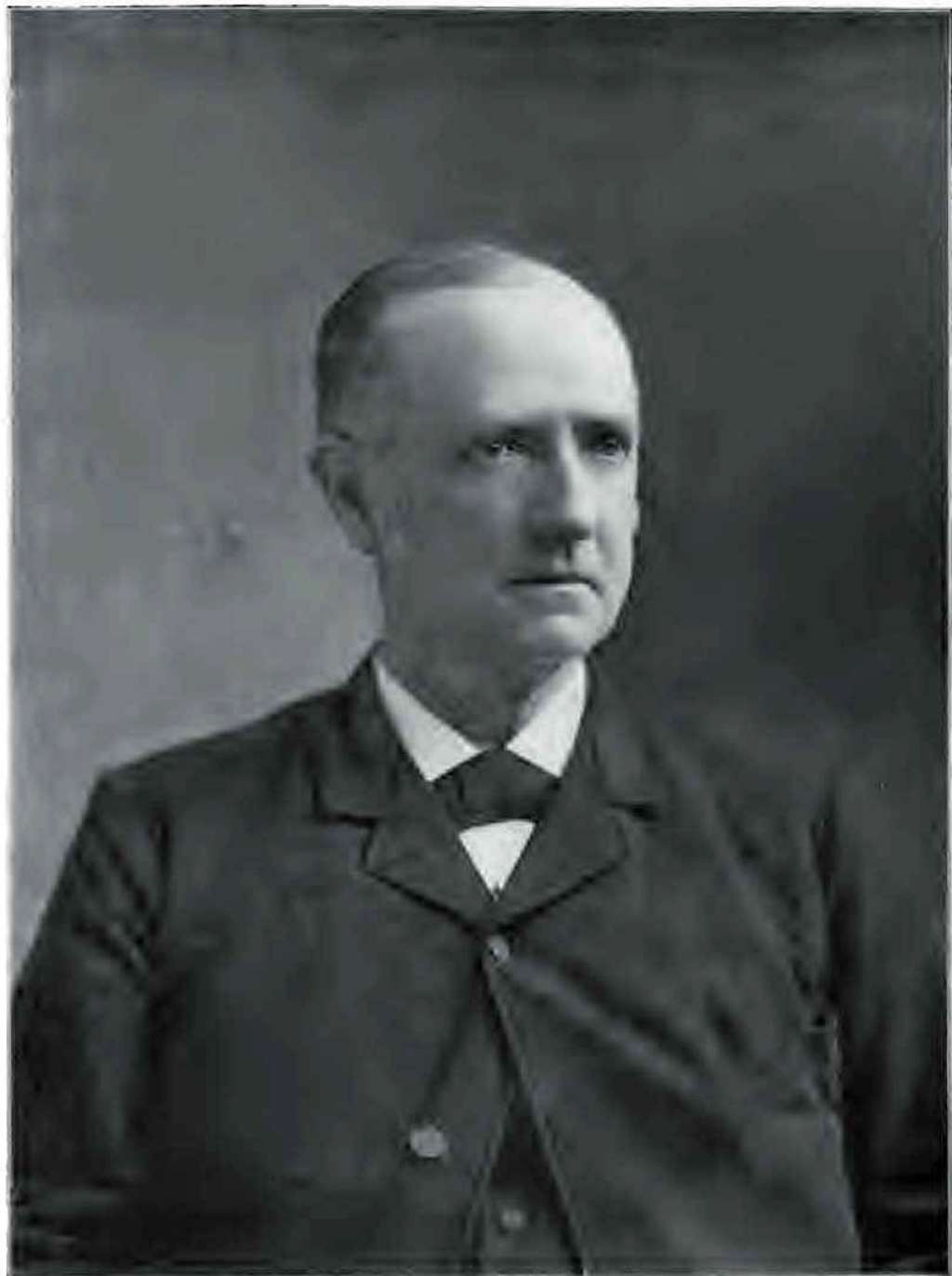
THEOPHILUS PARVIN, M.D., LL.D.